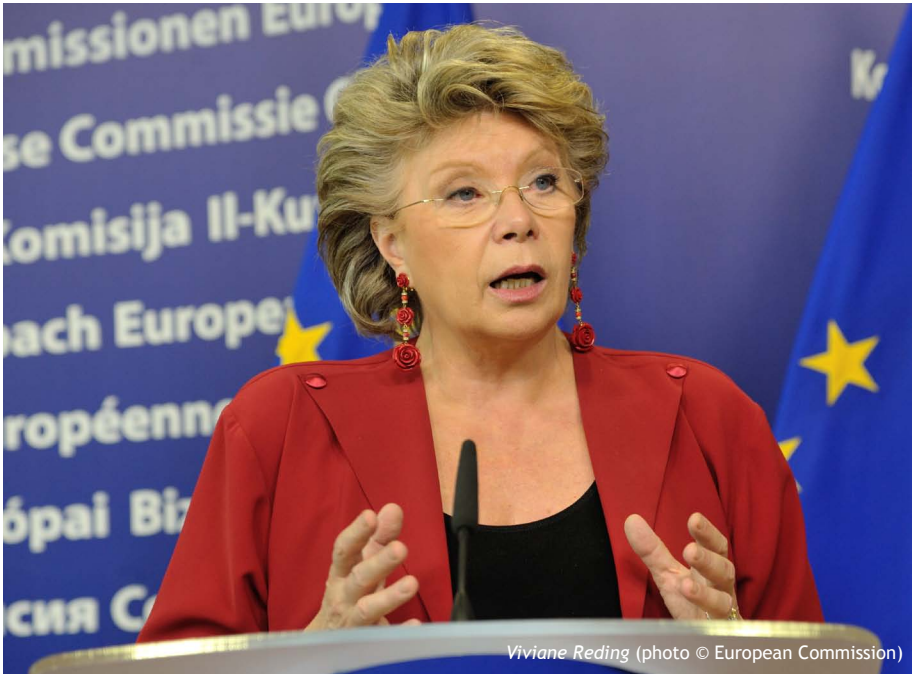
Viviane Reding

Vice-President of the European Commission and EU Commissioner for Justice, Fundamental Rights and Citizenship