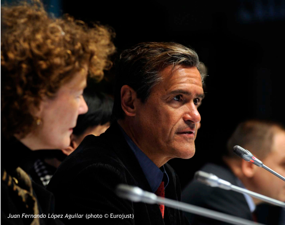
Juan Fernando López Aguilar

Member of the European Parliament and Chair of the Committee on Civil Liberties, Justice and Home Affairs (LIBE Committee)