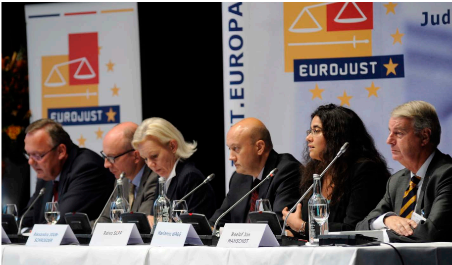
Eurojust-ERA conference in The Hague, November 2012

to a player with binding operational powers at vertical integration level". An increase in Eurojust's powers would entail an increase in its responsibilities and accountability to the European Parliament and national parliaments.