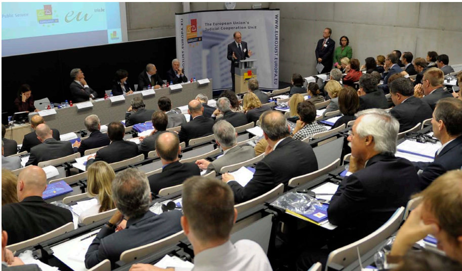
Eurojust strategic seminar in Bruges, September 2010

Presidencies, with the EU institutions, i.e. the European Commission, the Council and the European Parliament, partners, especially OLAF and Europol, academics and practitioners, to exchange views on the future perspective of a European Public Prosecutor's Office.